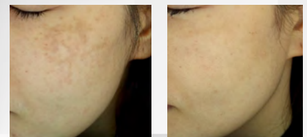
Before and After 1 Treatment