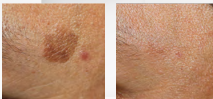
Before and After 2 Treatments